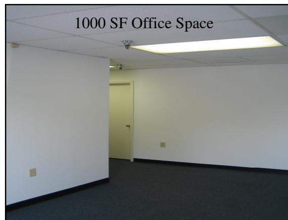
1000 SF Office Space

For more information on Pope Industrial Park visit: www.popeindustrialpark.com