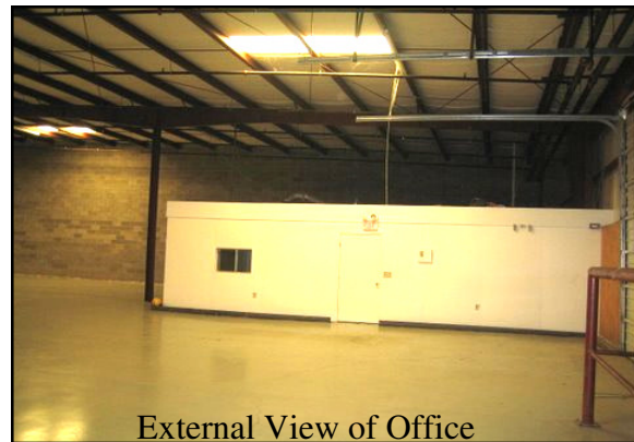
External View of Office