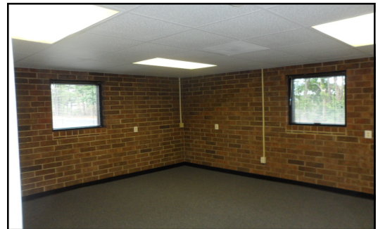
Comfortable Office Space