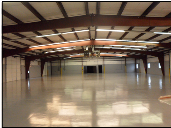
Free Span Building with Epoxy Floors